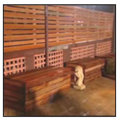
Balustrade: Scottie and team Kerba attached a 70x35mm batten to all upright metal posts of the balustrade with 50mm wing tip tech screws. We then horizontally attached Swan River Red (Boral) decking timber, 86x19mm alternating with 64x19mm, to the battens.

Scottie then set out the post position for a new pergola in our spit area and we concreted in 600mm long stirrups. We left this overnight to cure and then attached 90x90mm hardwood posts to the stirrups and 190x45mm roof beams around the perimeter of the posts to support two rafters. At the rear of this structure we attached a blueboard sheet 2.7m x 1200mm and tiled this surface in the same manner as our screen at the bottom of the garden.